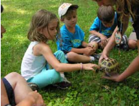
ANS summer campers enjoy Boris the Turtle.

Hands-on nature exploration and field trips allow thousands of kids annually to tune into nature and unplug from screens through ANS environmental education programs. ANS also provides wonderful opportunities for adults to connect with the natural world. From expanding programs for school-aged children to engaging teens in nature during the summer to steady enrollment in the ANS/ Graduate School USA Natural History Field Studies program, this year was full of accomplishments in Environmental Education.