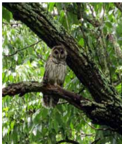
Barred Owl spotted during ANS outing near Carderock.