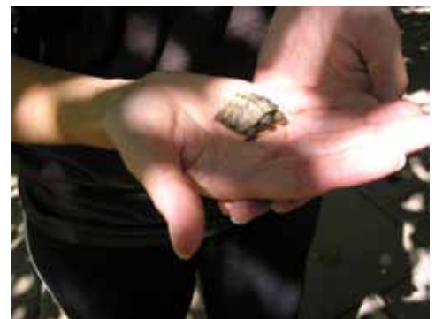
Baby box turtle found at Woodend